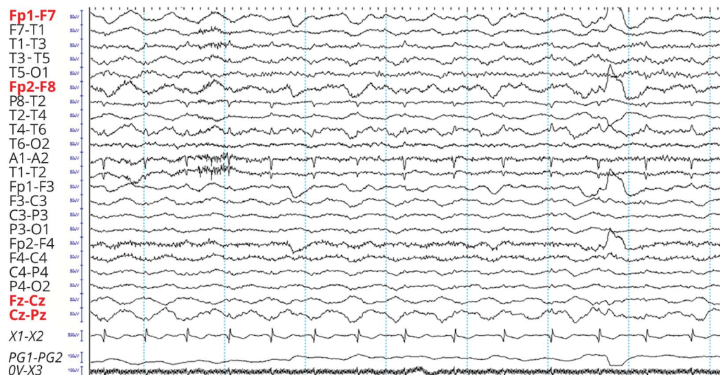
Figure 1 Scalp EEG shows no definite evidence of extreme delta brush

Waveforms resembling extreme delta brush were observed on repeat scalp EEG and are shown, but were neither persistent nor well-developed. Red leads indicate where these waveforms were observed.