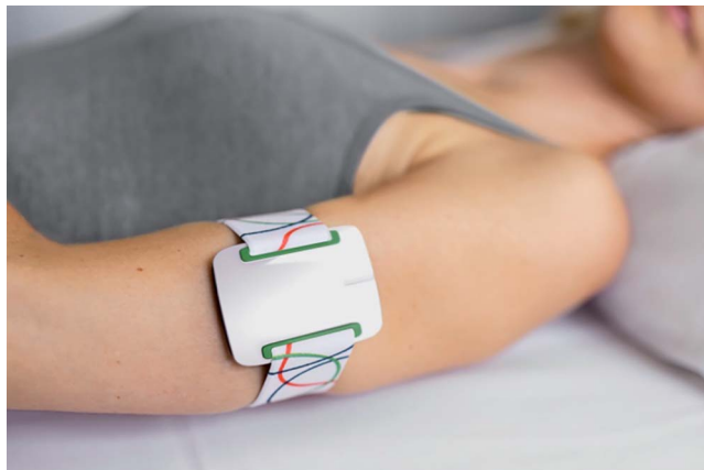
Figure 1 Multimodal sensor

The Nightwatch bracelet contains a photoplethysmographic heart rate module and a 3-dimensional accelerometer. The position on the upper arm was preferred to the wrist because of better signal quality and fewer movement artifacts. The signals or alarms are transmitted by DECT ultralow energy (DECT ULE) directly to the base, which may be connected to a local area network for further transmission of the data and alarms. DECT-ULE is a wireless communication standard with a greater range, reliability, and safety than Bluetooth or Wifi.