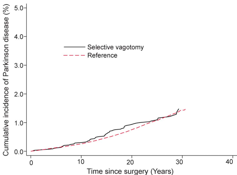
Figure 2 Cumulative incidence of PD among selective vagotomized patients and their matched reference individuals

Standard protocol approvals, registrations, and patient consents. The study was approved by the Regional Ethics Review Board in Stockholm. Because this study included analyses of deidentified data, written consent from participants was not required.